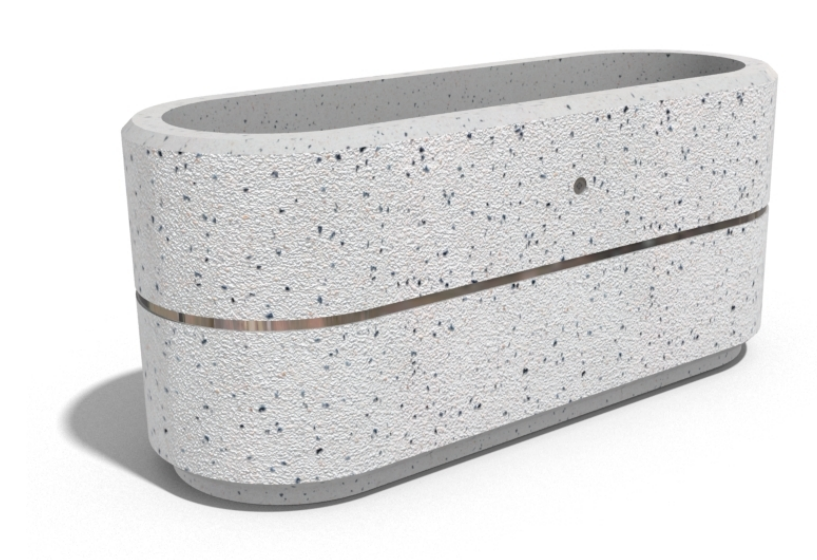
Logo Stainless Steel: