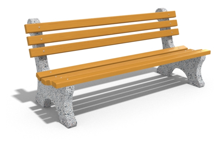
BOLT Stainless Steel: